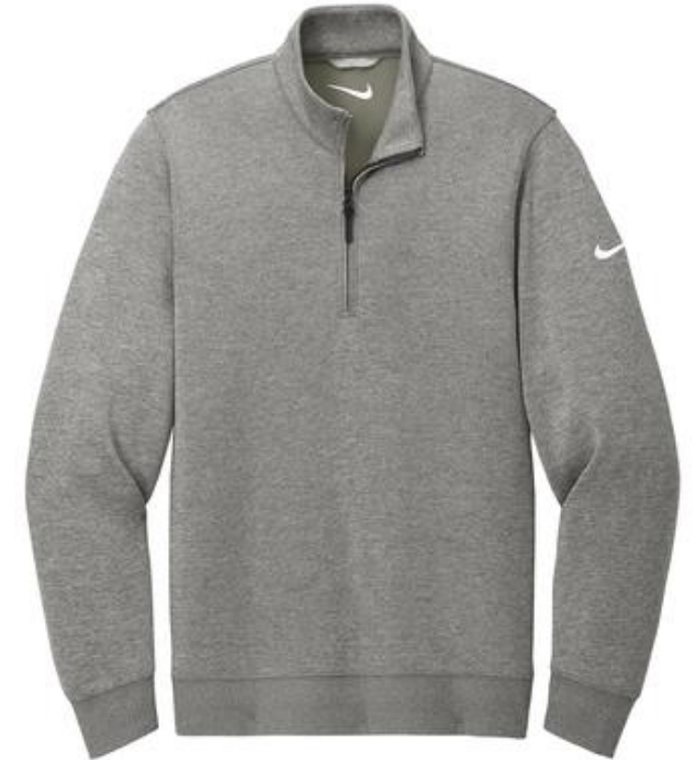
Classic Work to Play Minimal Branding with a Retail Feel