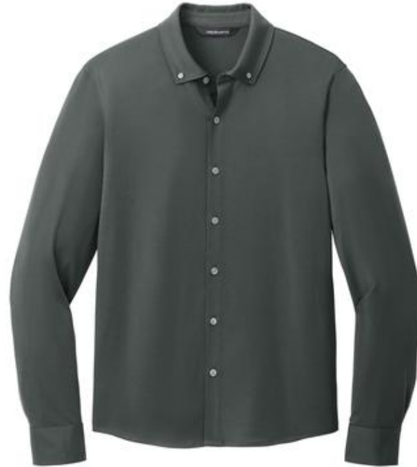
Modern Button Down Modern Decoration