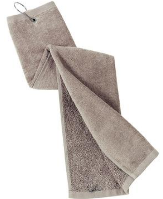
Event Merch You'll Want to Keep with a Premium Look