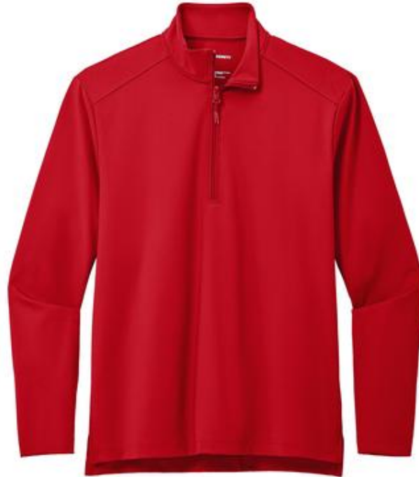
Athleisure that Bleeds Flexible Deco with a Blocker