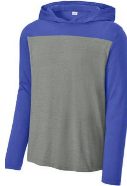
Trendy Lightweight Pullover Multicolor Low Temp Decoration