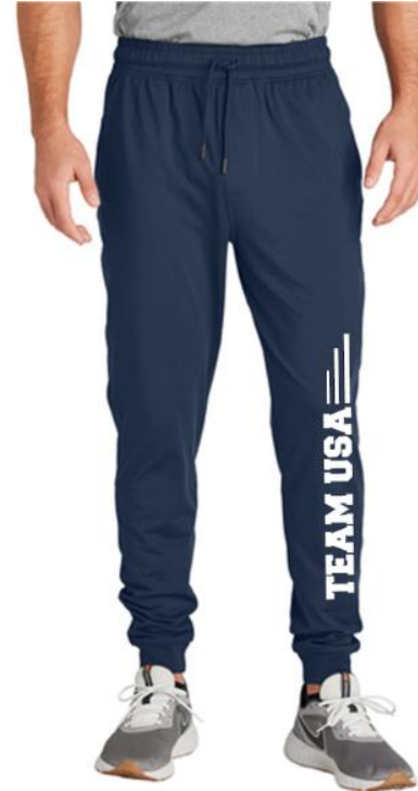
Trendy Athleisure Trending Dimensional Decoration