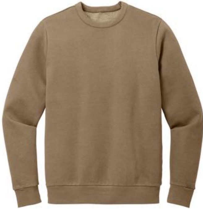
The Upgraded Sweatshirt Popular Decoration