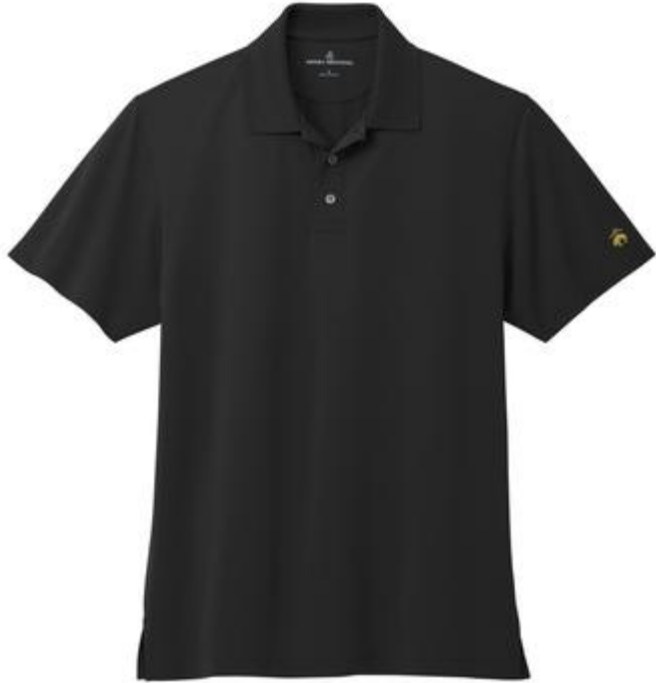
The Power Polo Metallic Decoration